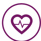
HEALTH CASH PLAN