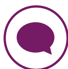
EMPLOYEE ASSISTANCE PROGRAMME (EAP)